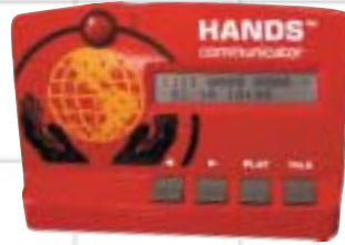
THE HANDS COMMUNICATOR